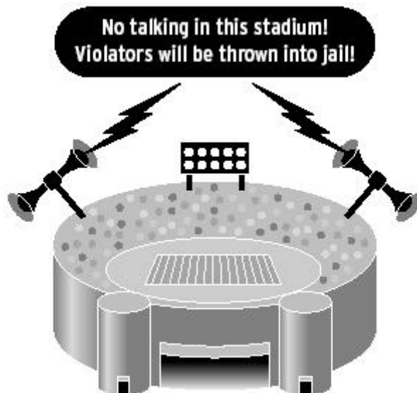
Figure 3. Acoustic Spectrum Analogy to the FCC Ban on Broadcast Underlays

As radio receivers become more intelligent—that is, better able to discriminate among multiple signals—we believe that the ban on unlicensed underlays is becoming more and more onerous. Just as fans should be able to communicate with their neighbors without the permission of the announcer, we believe citizens should be able to use the spectrum in their homes without the permission of broadcasters.